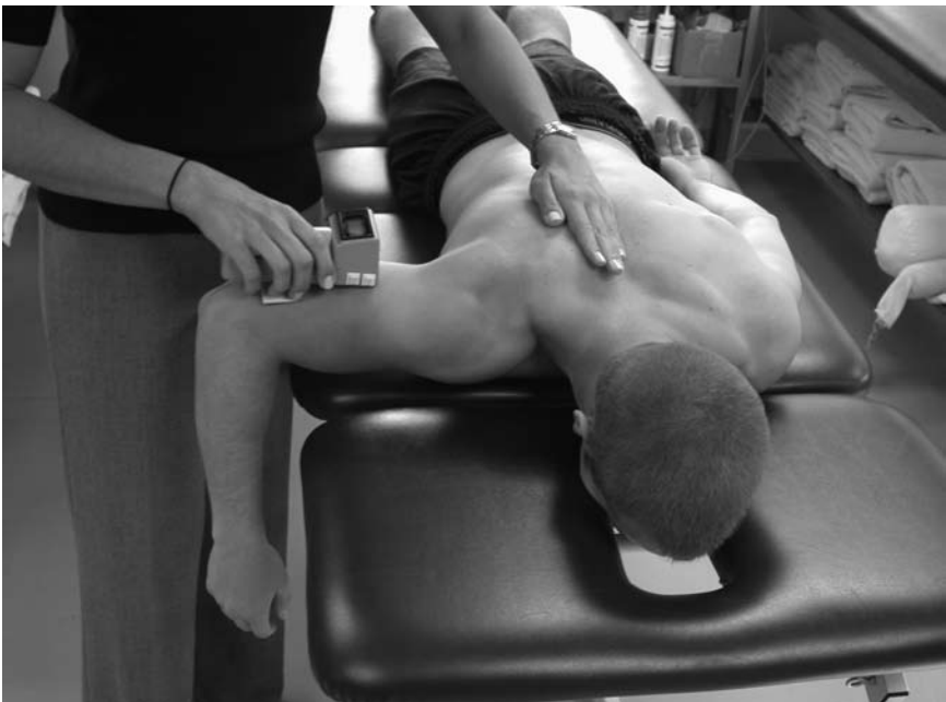
Figure 1 — Position for scapular-retractor-strength testing using a handheld dynamometer.

Bilateral scapular-retraction strength was tested using a handheld dynamometer (Lafayette Instruments, IN; Figure 1). Subjects were in the prone position with the elbow extended and the glenohumeral joint in 90° of horizontal abduction according to the manual-muscle-testing protocol for the scapular retractors described by Daniels and Worthingham. 23 The average of 3 test trials for each shoulder was recorded.