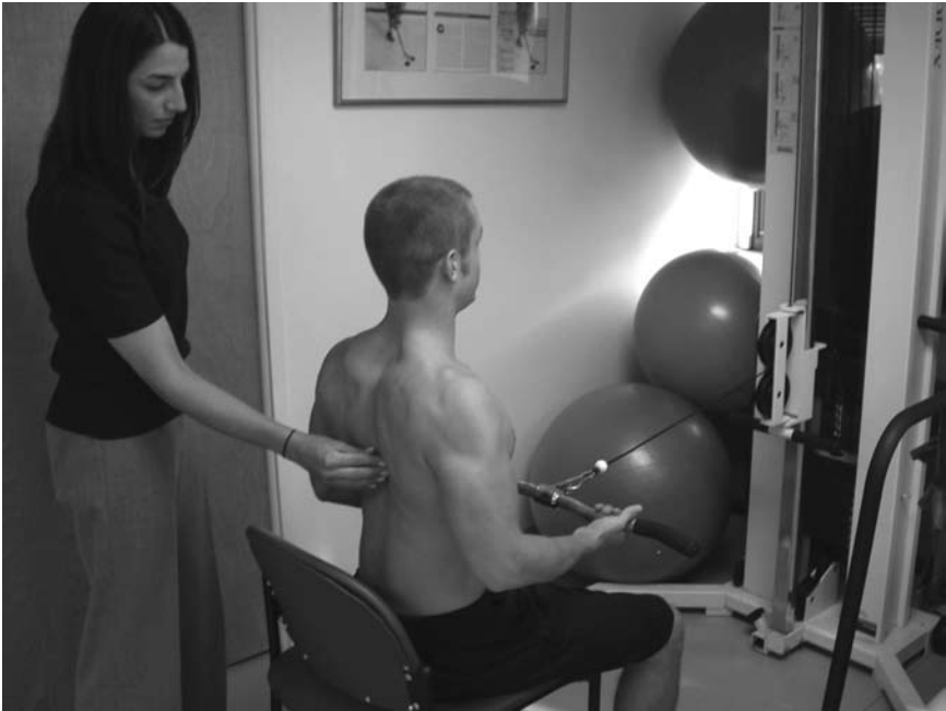
Figure 2 — The tester uses tactile and verbal cues for complete scapular retraction on each repetition during the scapular-retractor-fatigue protocol.

After scapular-retraction-strength measurements, participants were instructed on how to perform a seated rowing exercise to fatigue the scapular retractors using a standard-design cable column with weight stack for isotonic weight training. They were seated in a chair without arms and instructed to sit with their back flush against the chair back during the entire exercise, with both legs flexed and feet on the floor (Figure 2). The resistance was set at 40% of subjects' body weight, and subjects performed the exercise to "failure" as determined by the tester according to the following criteria: (1) inability to retract the scapula completely before rowing on 3 consecutive repetitions, (2) inability to maintain seated posture against the seat back for 3 consecutive repetitions, or (3) inability to break the frontal plane at the midaxial region with the elbows on 3 consecutive repetitions while maintaining proper exercise technique. The tester used tactile and verbal cues to ensure complete scapular retraction on each repetition. When the point of failure was reached subjects were again tested for scapular-retraction strength. Isokinetic internal- and external-rotation-strength testing was repeated within 3 to 5 minutes of the postexercise scapular-retraction-strength test.