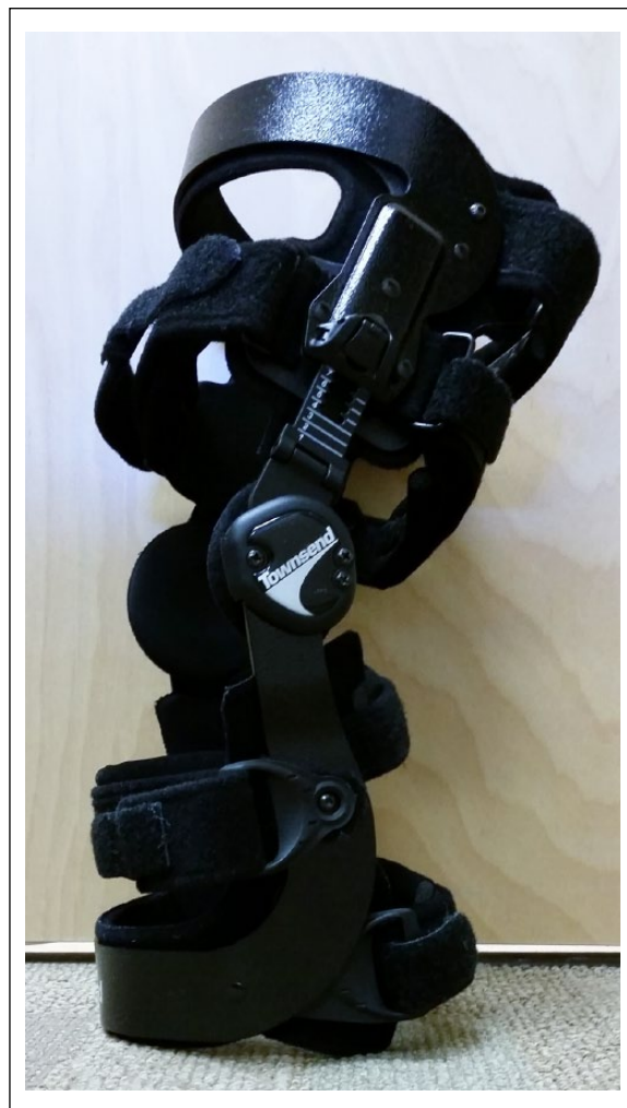
Figure 1. Picture of the Townsend Rebel Reliever brace.

Participants with diagnosed knee OA between the ages of 35 and 70 years were recruited to participate. Inclusion criteria were unilateral, medial compartment OA of the knee diagnosed by an orthopedic physician and classified on the Kellgren–Lawrence scale. Specific exclusion criteria included cardiac or pulmonary disease that limits ability to walk; presence of hip, ankle, foot, or contralateral knee OA; surgical procedure in either leg within the past 6 months; or the presence of other lower limb pathology that limits the ability to walk. All participants received a prescription for the brace and provided